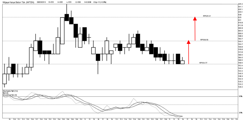
Kinerja saham WTON

Danareksa research report are also available at Reuters Multex and First Call Direct and Bloomberg